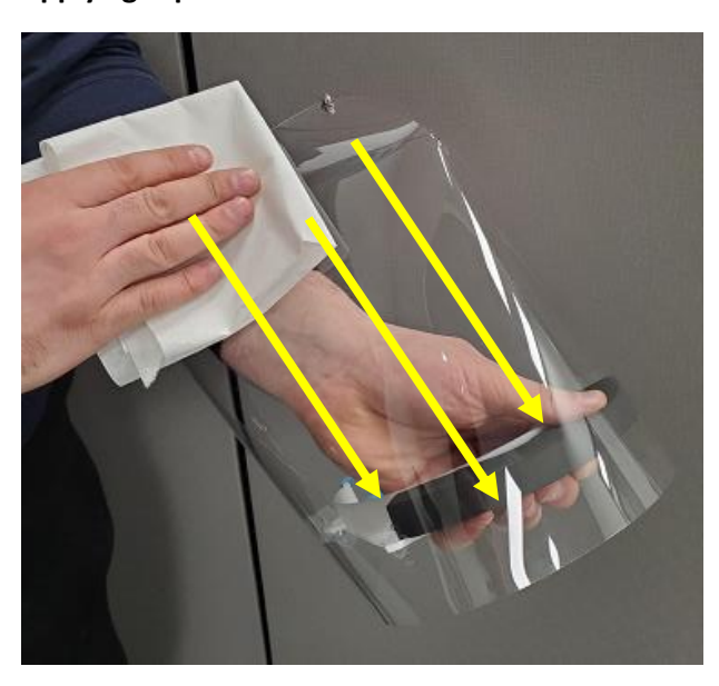
<u>NOTE</u>: Shield material is not meant for high impact or load bearing. DO NOT store under weight in lockers, duffle bags, etc...