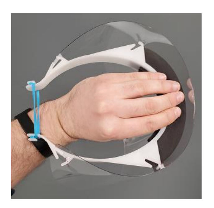
3. A proper grasp of the halo shield is shown above