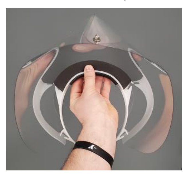
2. Hold the top of the halo with your remaining fingers as shown